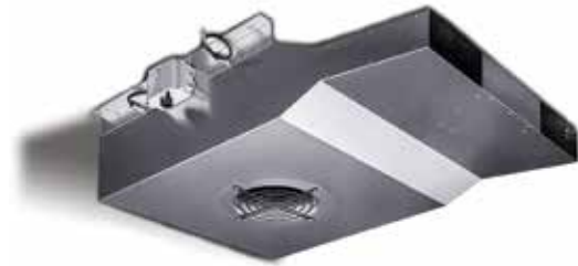
EC Jet Series